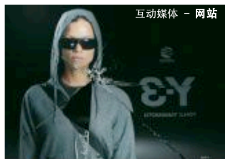
互动媒体 - 网站