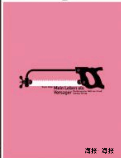
海报 - 海报