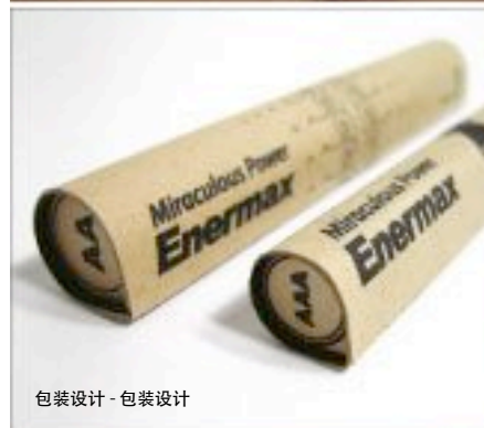
包装设计 - 包装设计