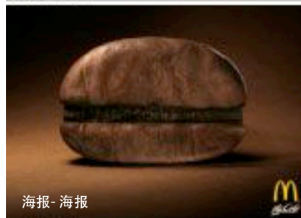
海报 - 海报