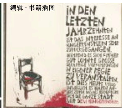
编辑 - 书籍插图