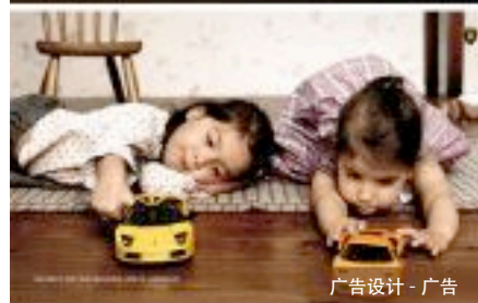
广告设计 - 广告