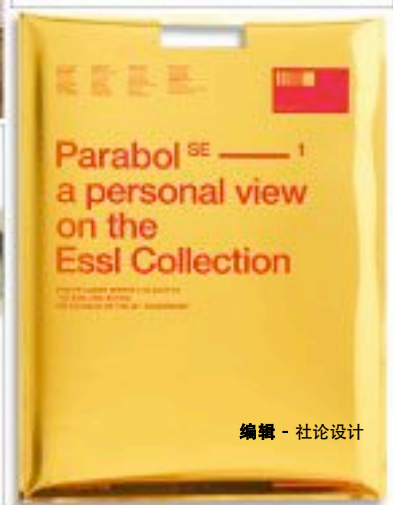
编辑 - 社论设计