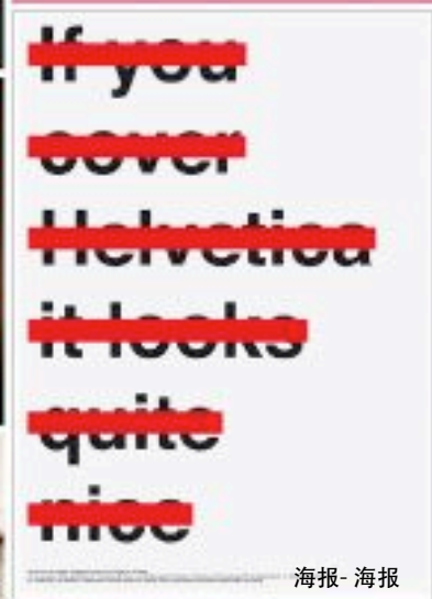
海报 - 海报